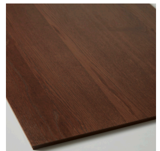
Rustic Antique Oak