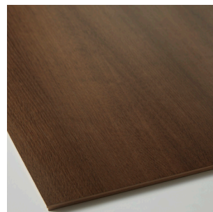
Rustic Smoked Oak