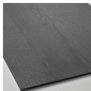
Rustic Grey Oak