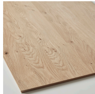
Rustic Natural Oak