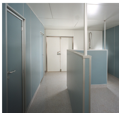
SPACE WALL PANELS