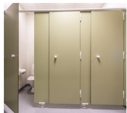
BASIC CUBICLE SYSTEMS