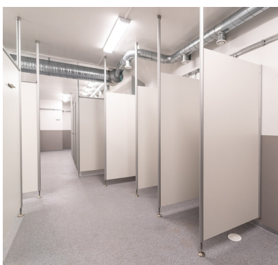
SPACE CUBICLE SYSTEMS